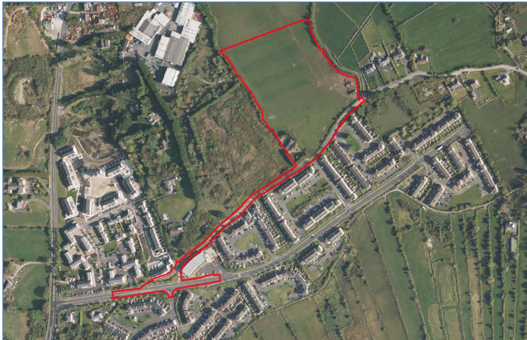
Figure 3: Site Extents