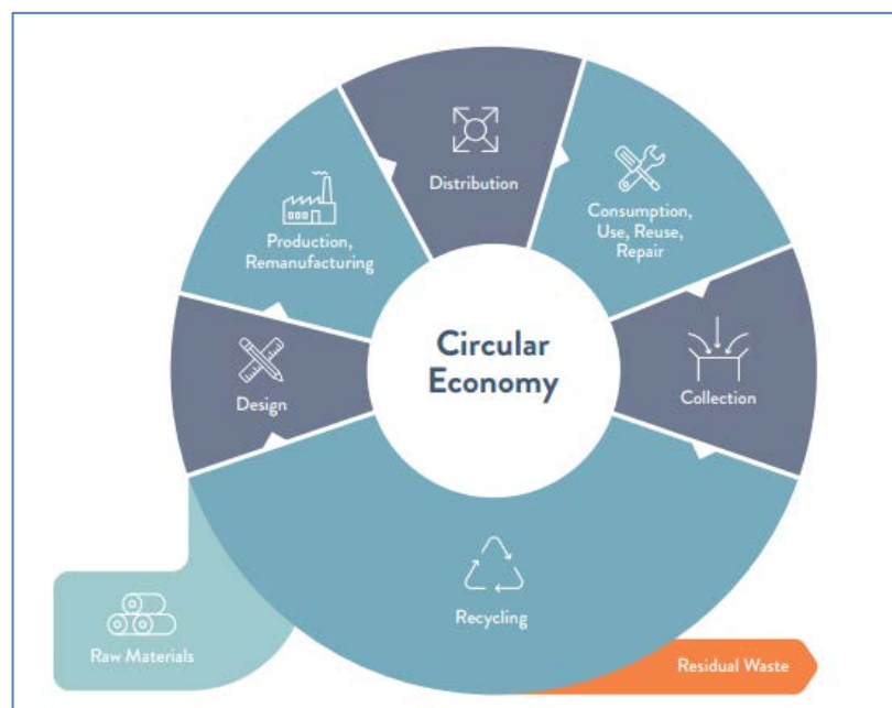
Figure 1 The Circular Economy

In respect of C&D waste specifically, the plan outlines that a review of producer responsibility initiatives will examine the appropriate financial mechanisms to ensure compliance by producers with their obligations and that those sectors which are generating significant waste, and which do not have successful voluntary initiatives in place, will be considered for specific regulation as part of the review. The document states that specific producer responsibility requirements for construction and demolition projects over a certain threshold will be considered.