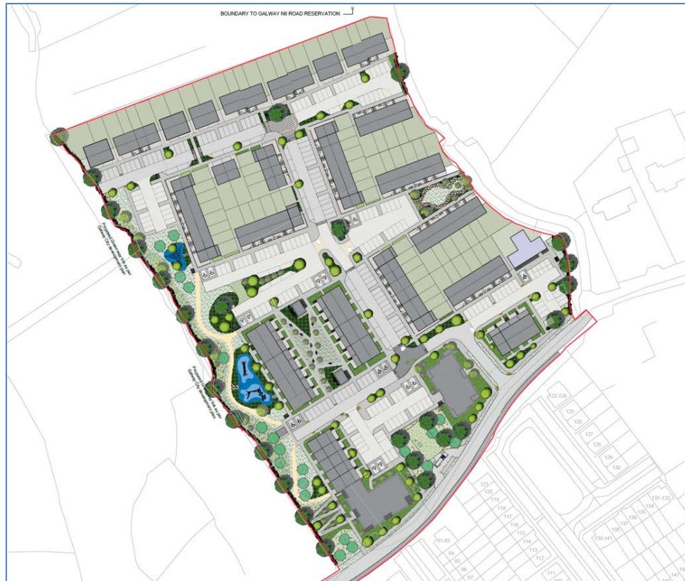
Figure 4: Proposed Site Layout