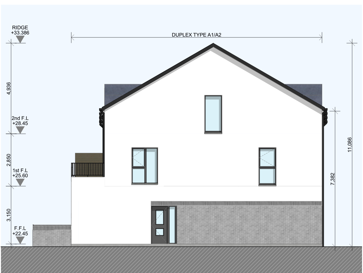
4 Side Elevation A 1:100