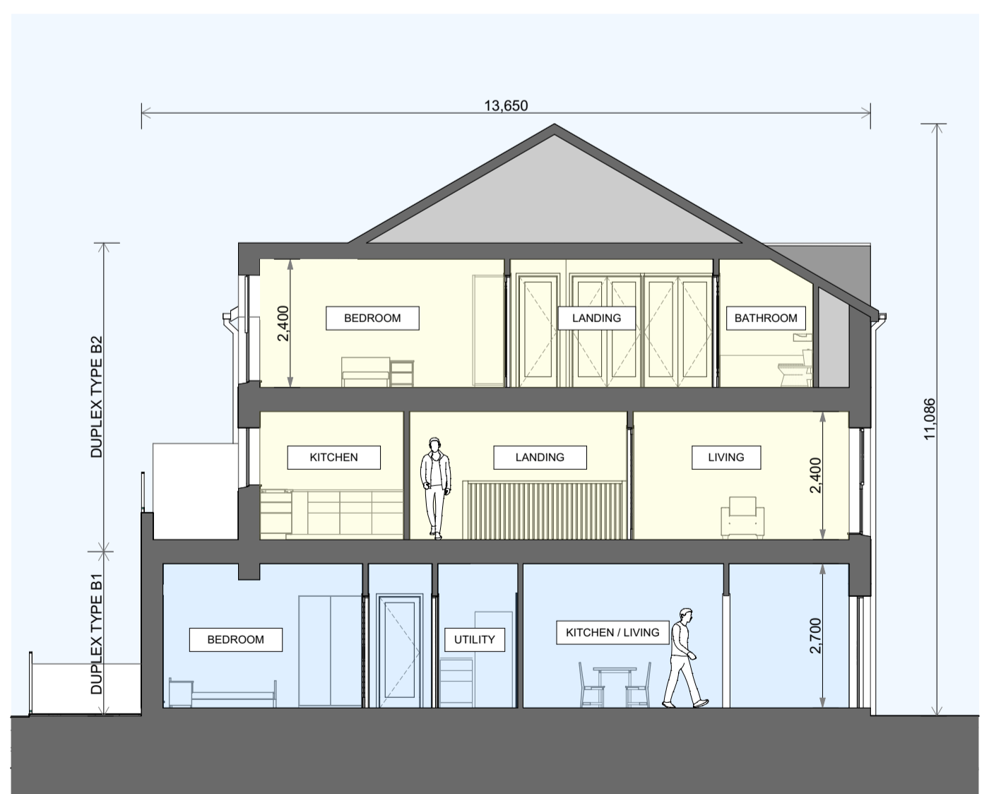
3 Section A-A 1:100