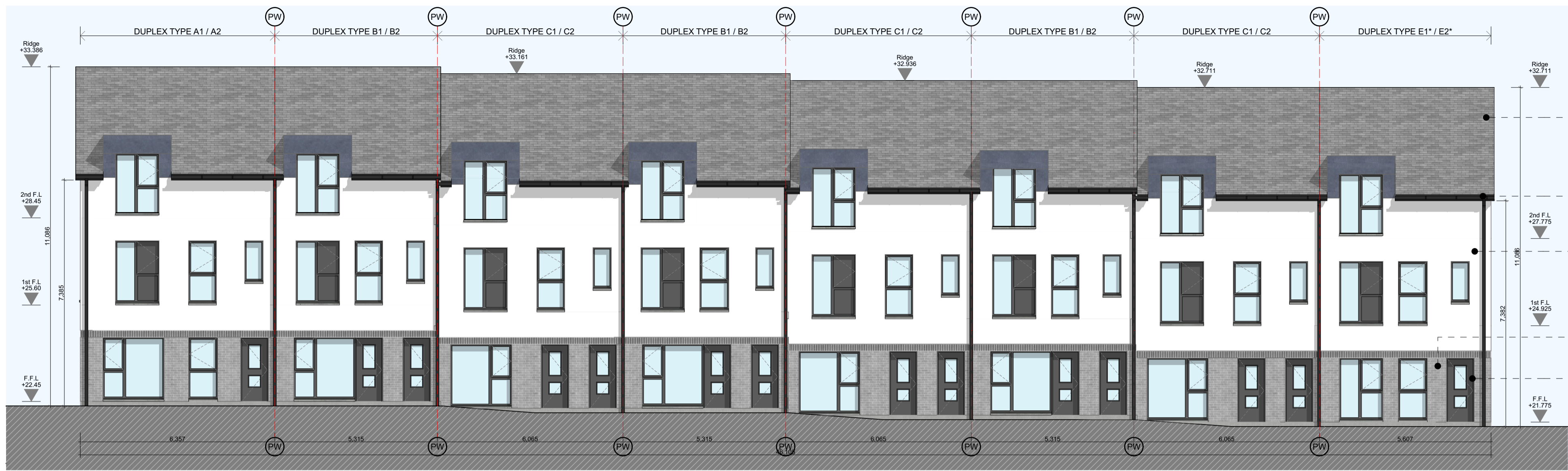
1 Front Elevation 1:100