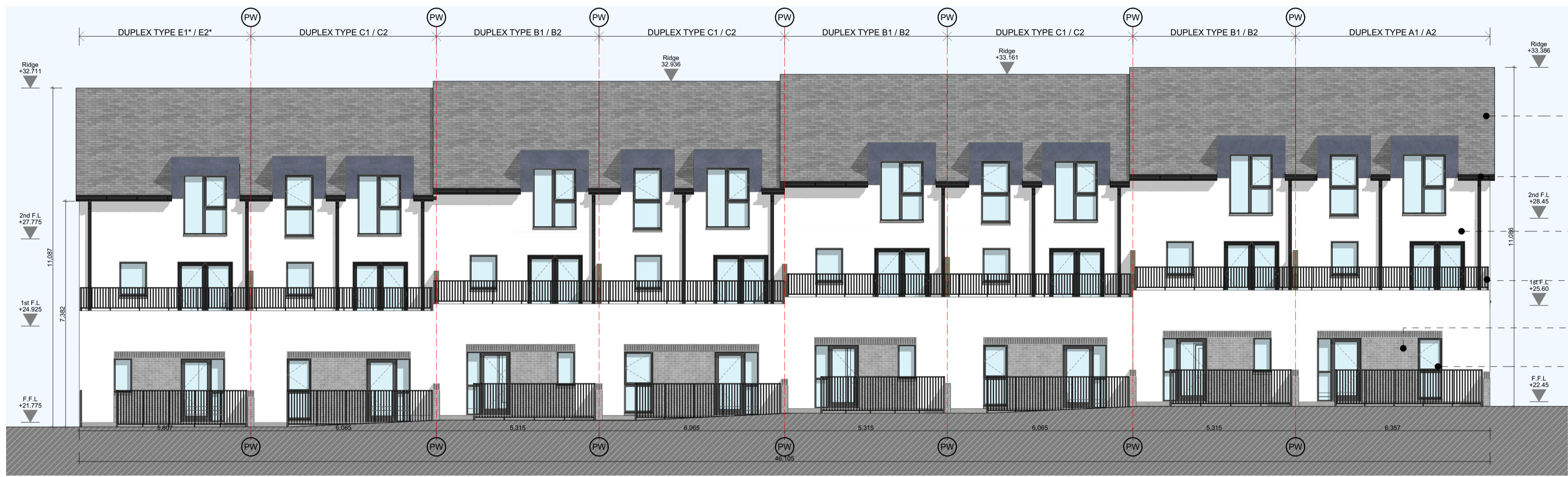
2 Rear Elevation 1:100