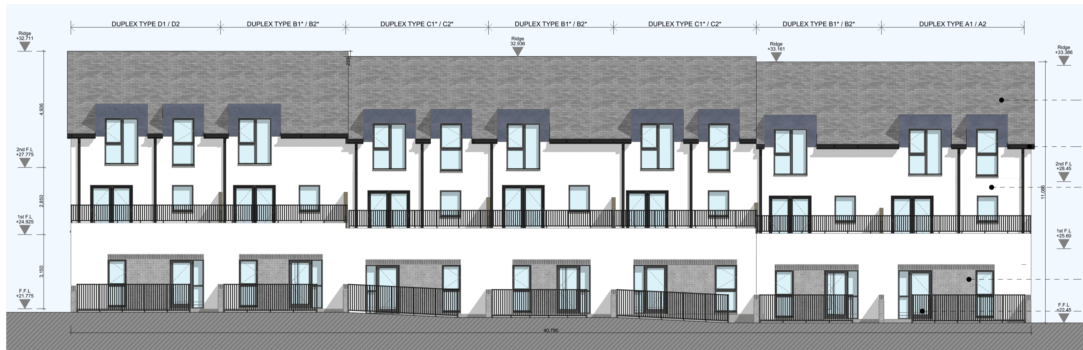
2 Rear Elevation 1:100