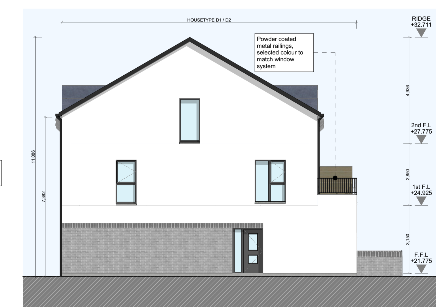
5 Side Elevation 1:100