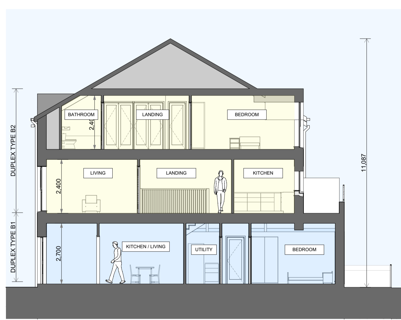
3 Section A-A 1:100