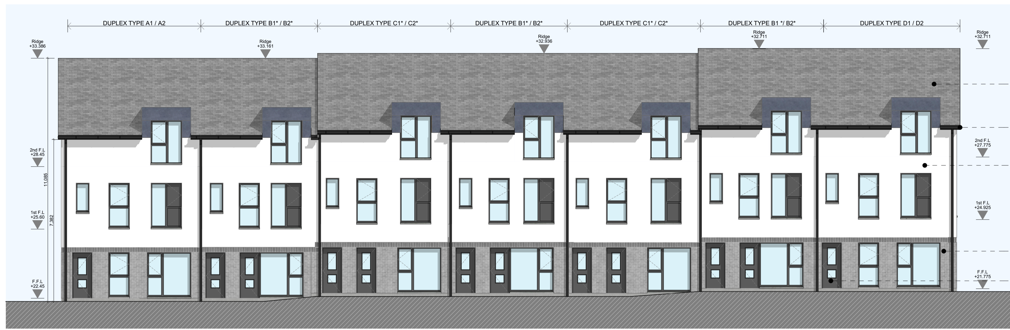
1 Front Elevation 1:100