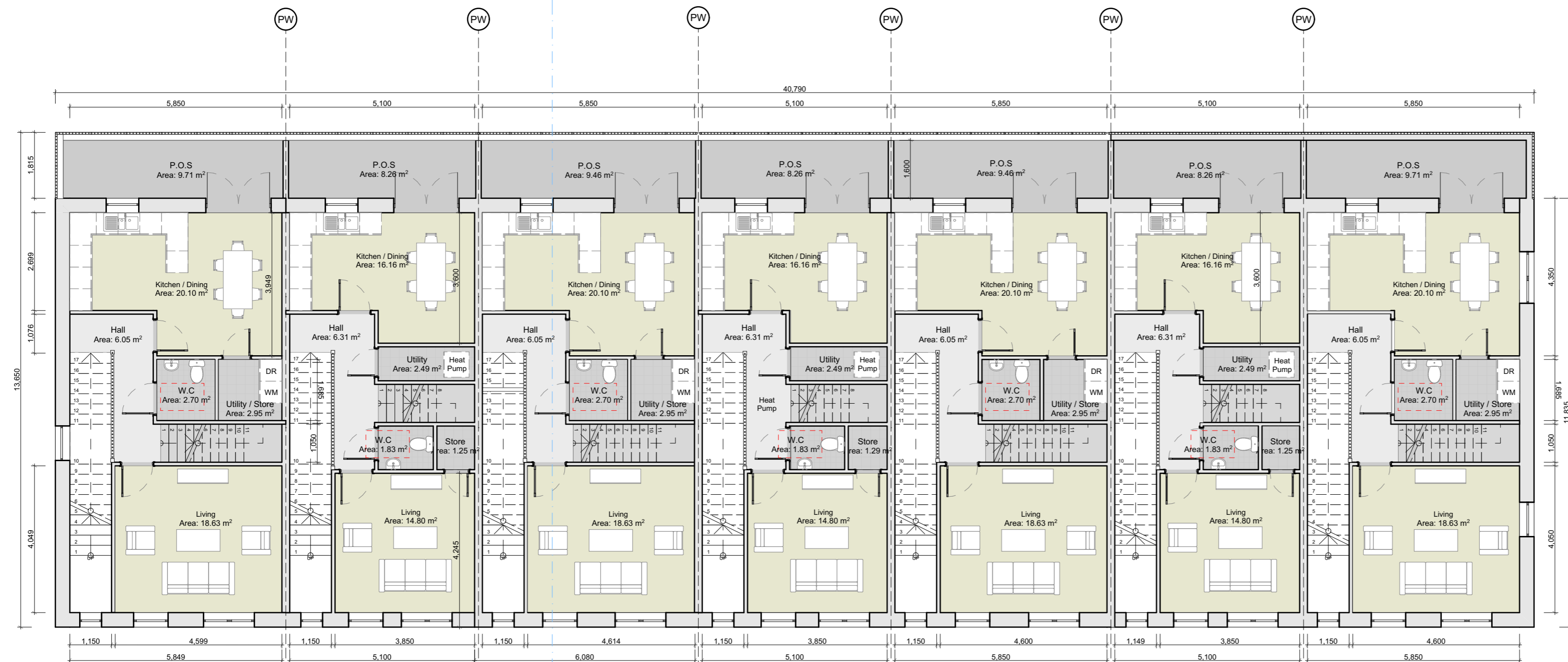
First Floor Plan 1:100