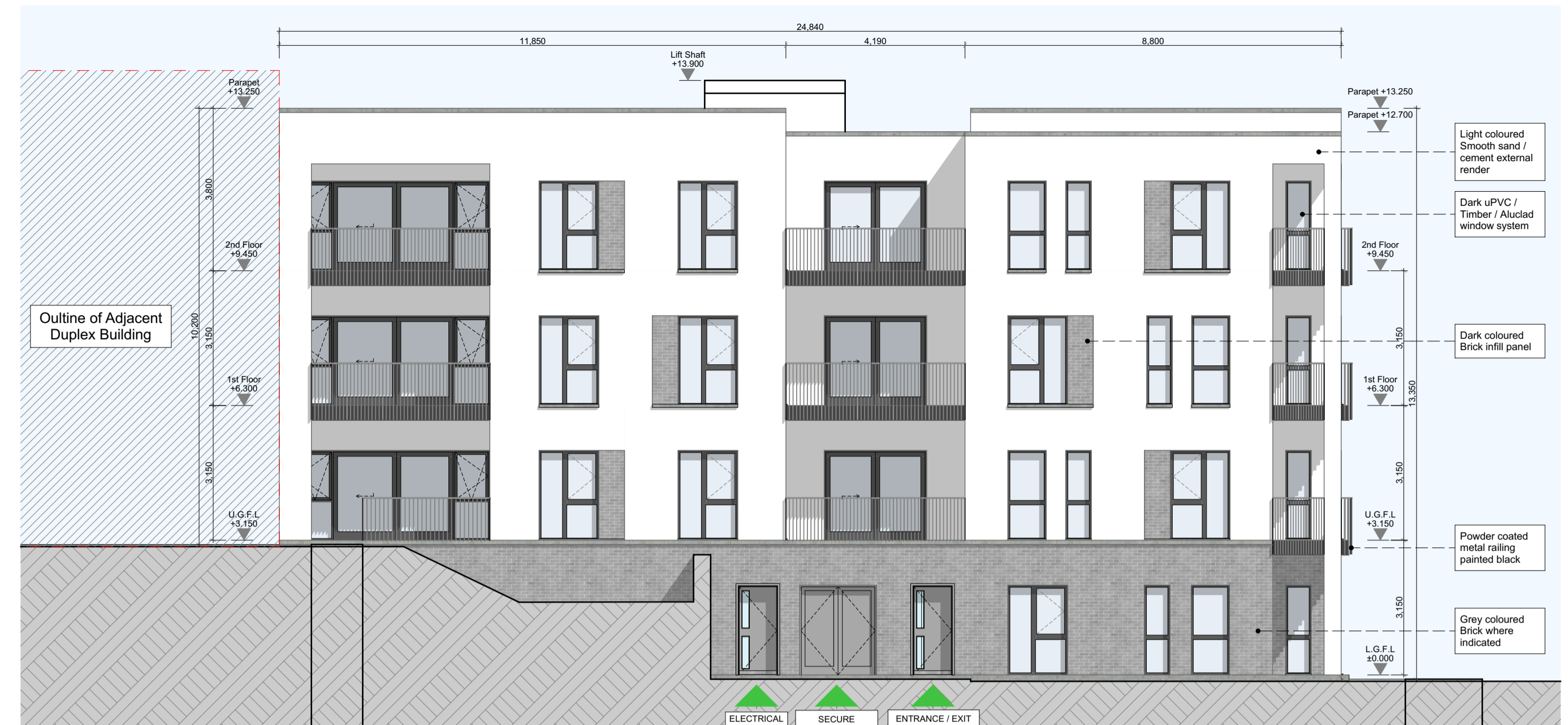
South-West Elevation 1:100