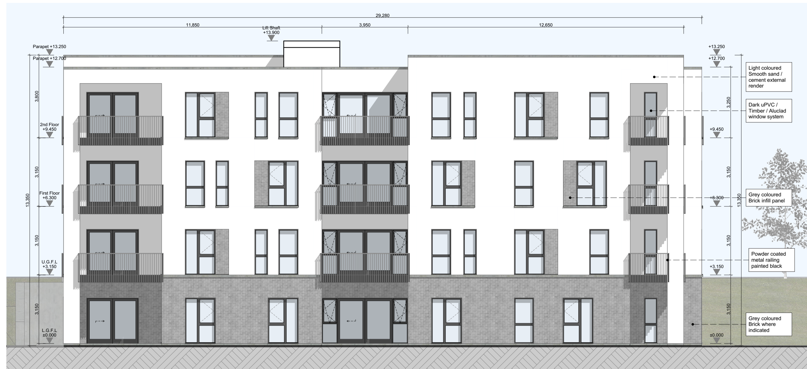
South-East Elevation 1:100