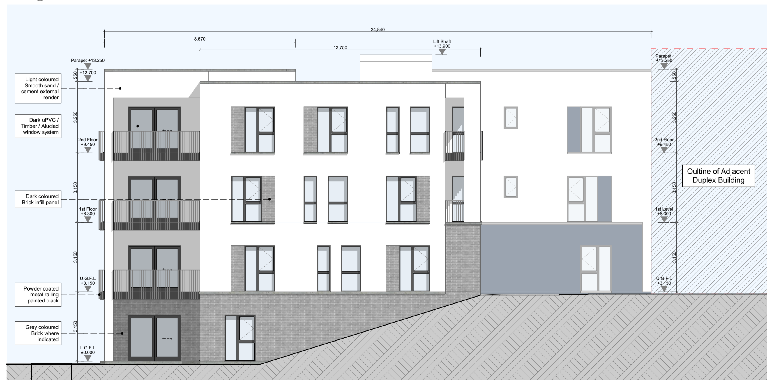
Sout-East Elevation 1:100