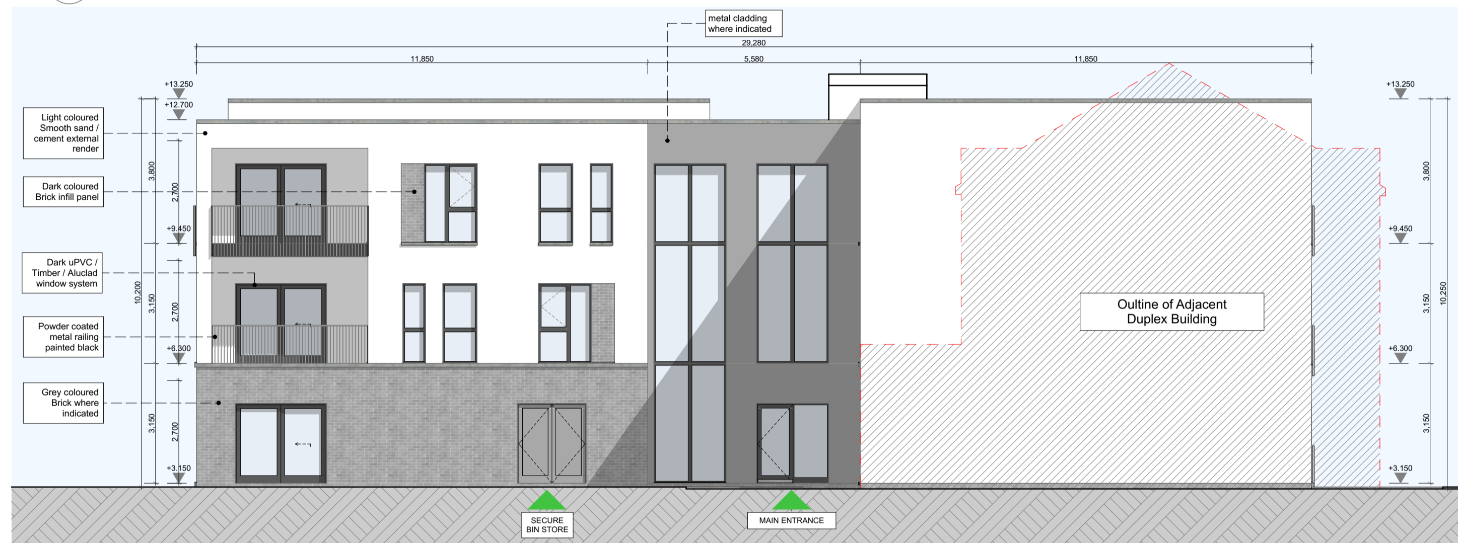
North-East Elevation 1:100