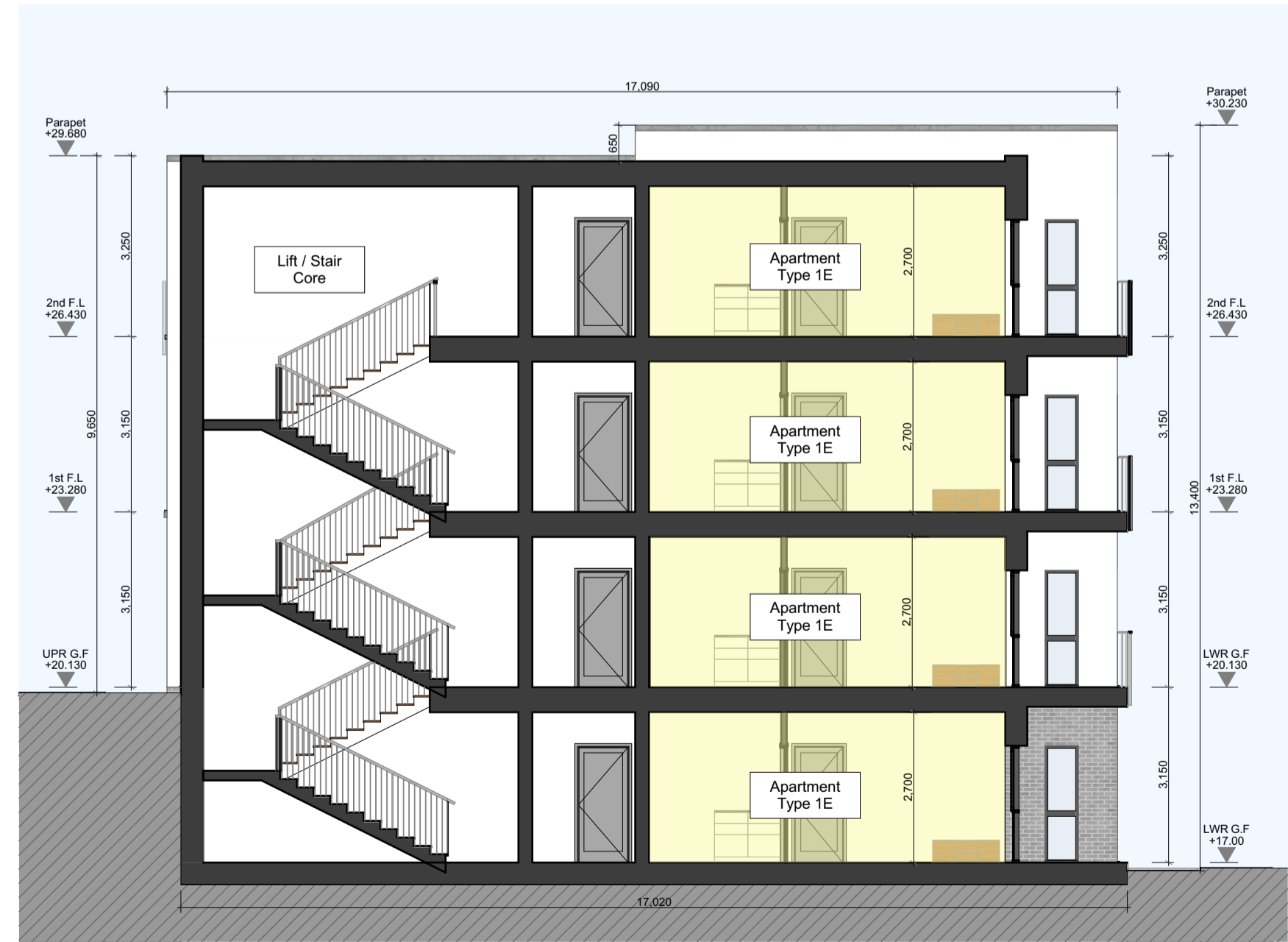
3 Section A-A 1:100