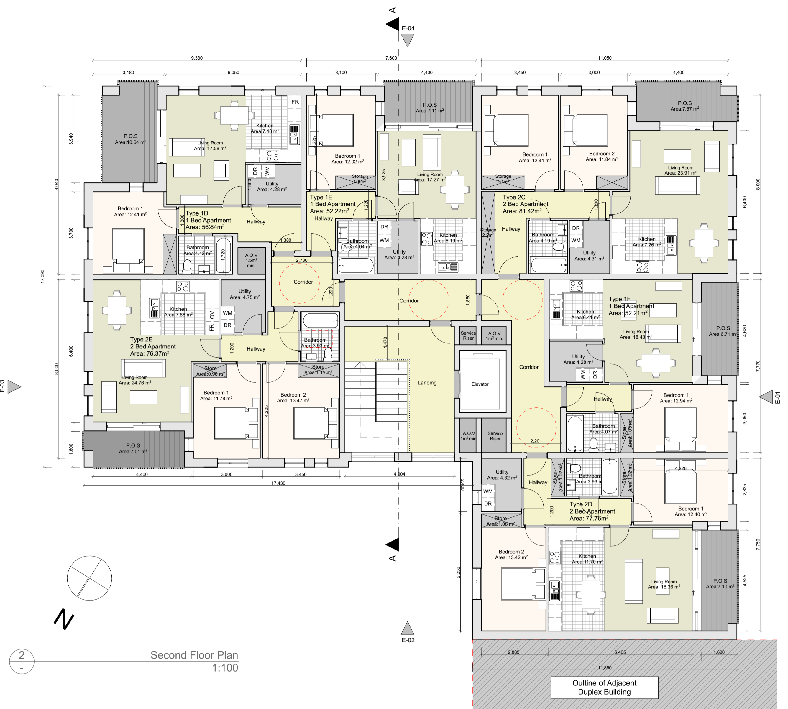
2 Second Floor Plan 1:100