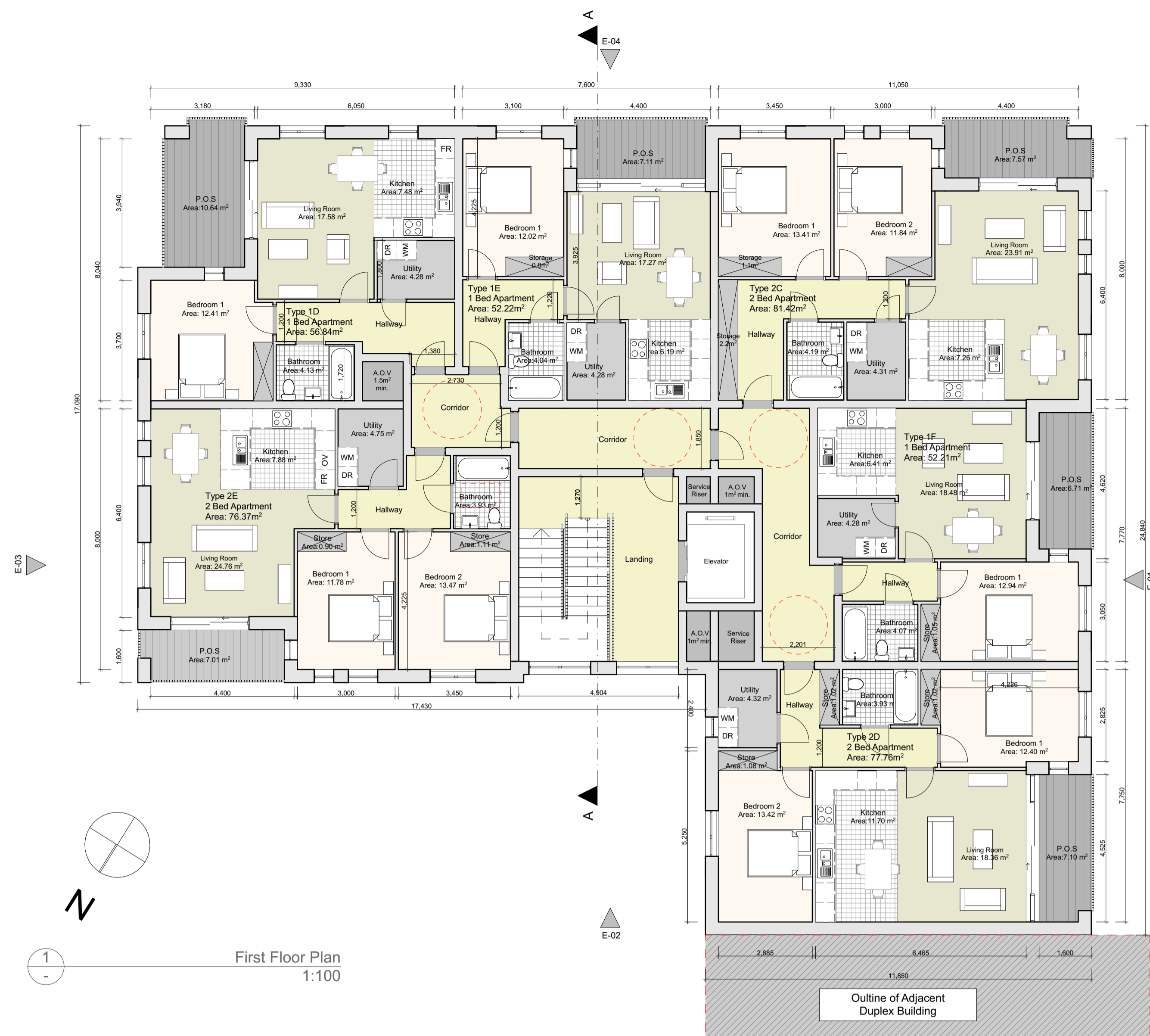
1 First Floor Plan 1:100