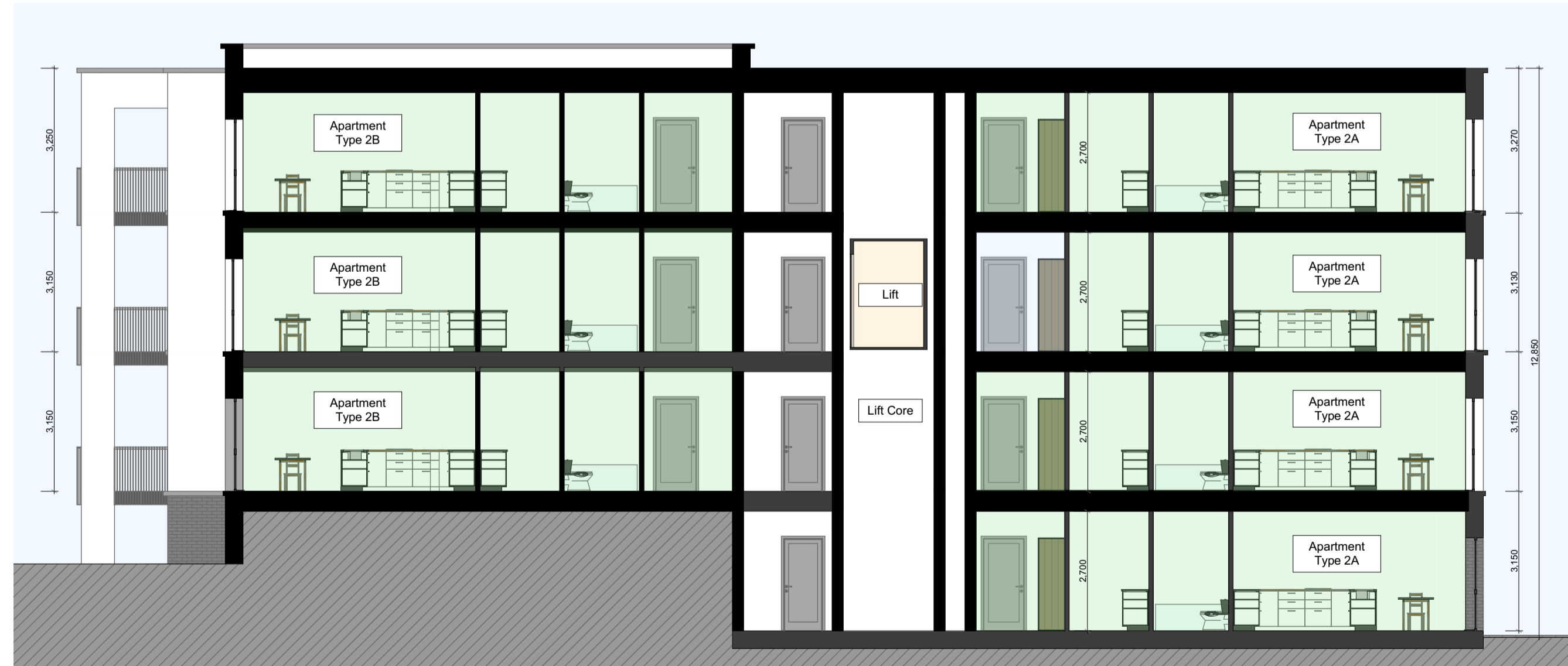
6 Section B-B 1:100