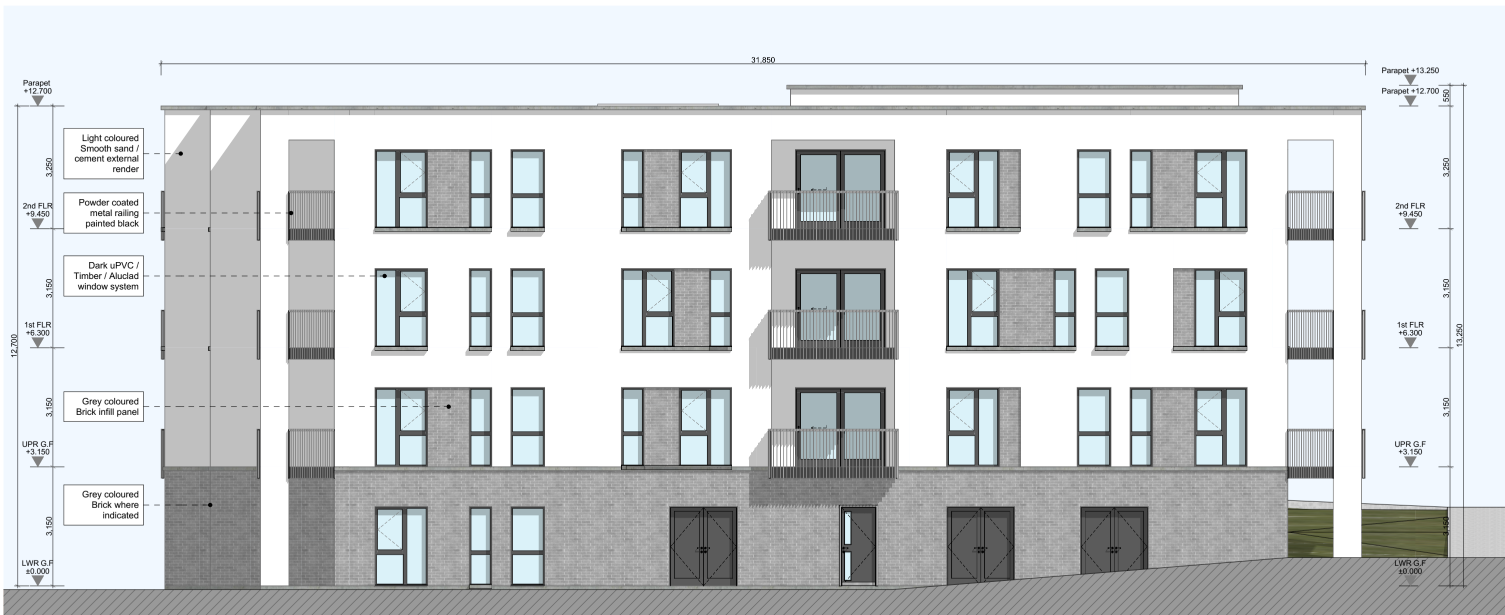
3 E-03 North-East Elevation 1:100