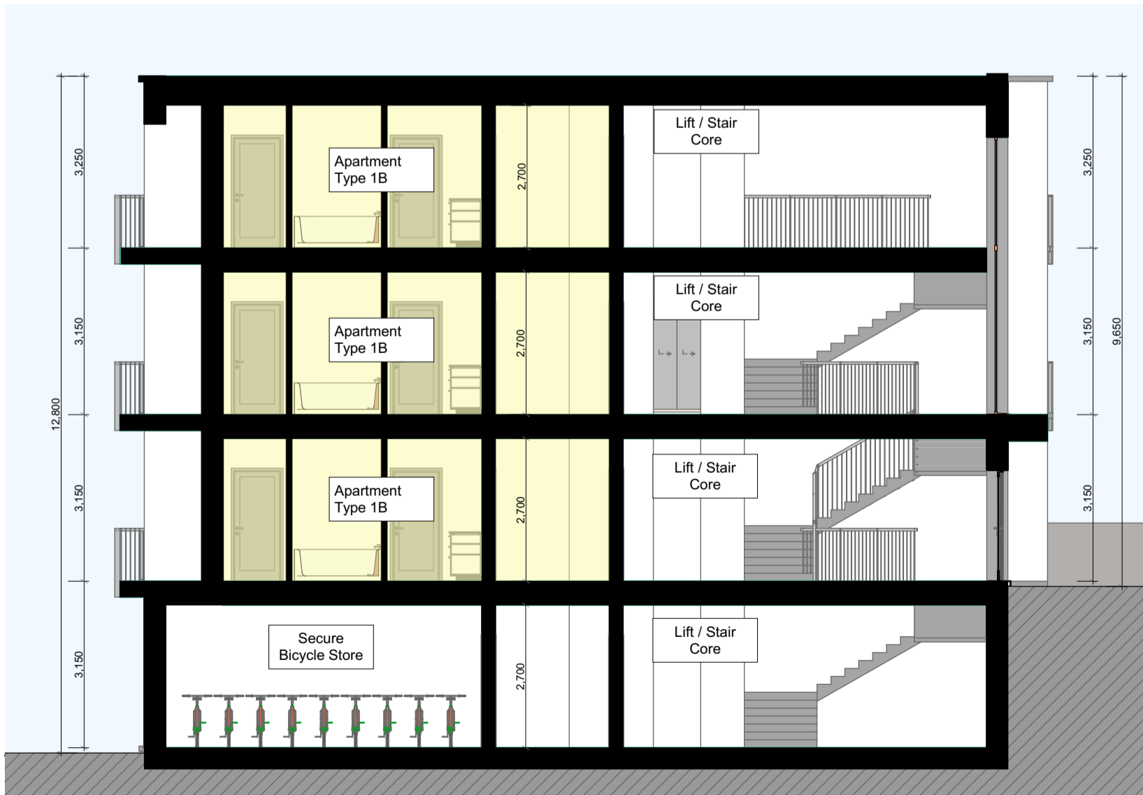
5 Section A-A 1:100

THIS DRAWING TO BE READ IN CONJUNCTION WITH ARCHITECT'S DRAWINGS, CONSULTANT ENGINEER'S DRAWINGS AND SPECIFICATIONS.