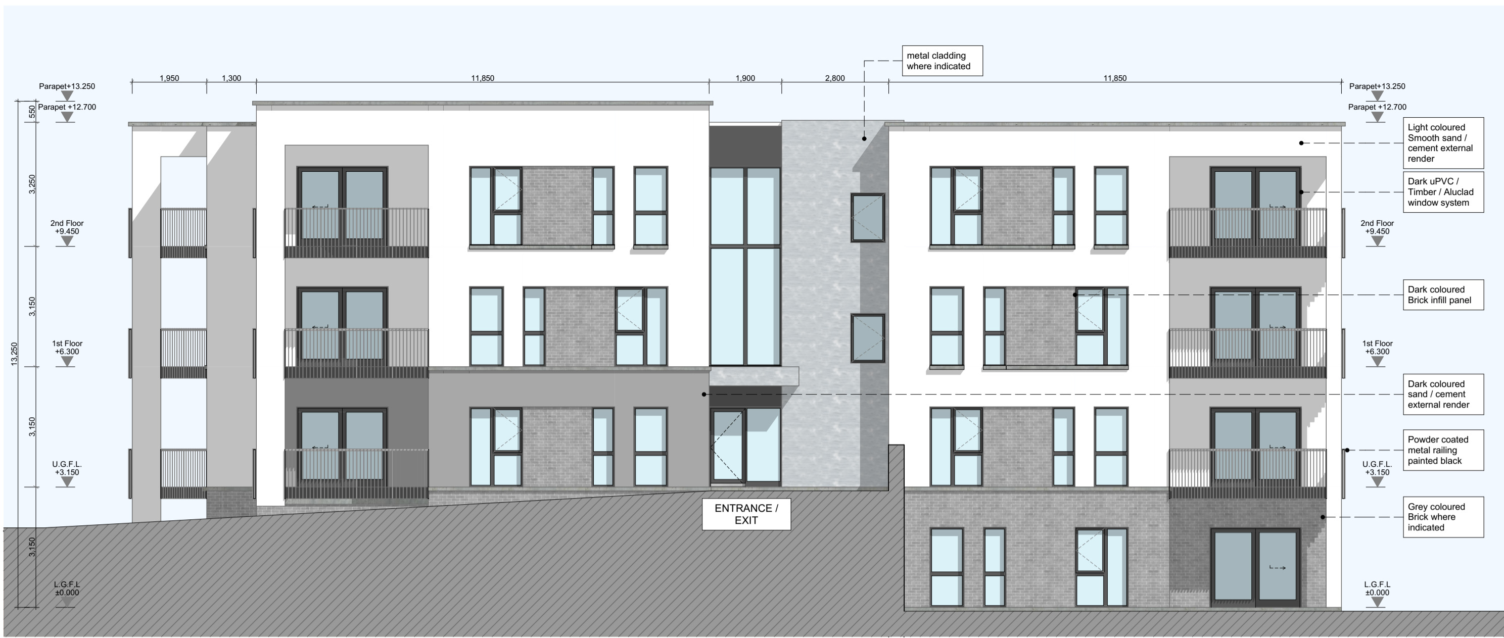
1 E-01 South-West Elevation 1:100