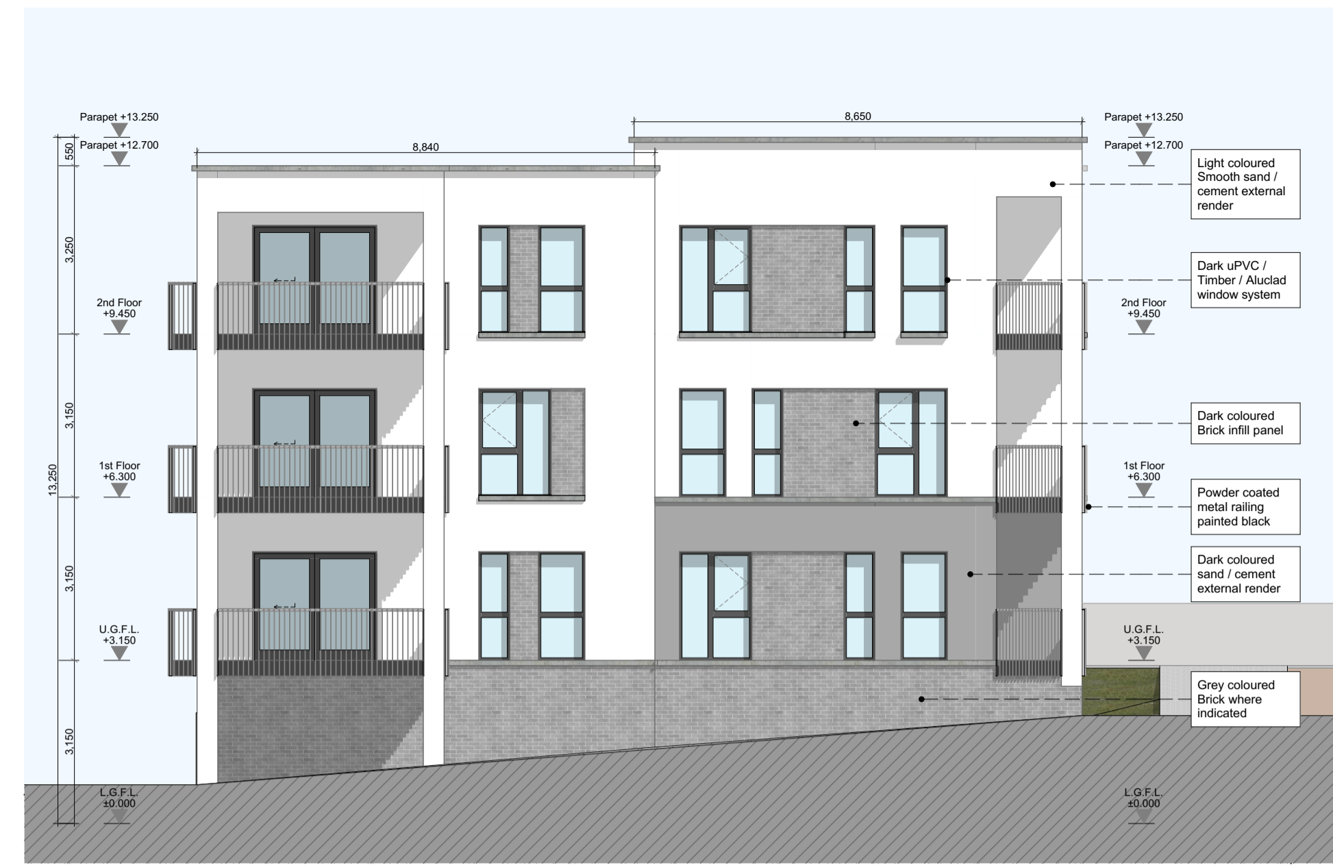
2 E-02 North-West Elevation 1:100