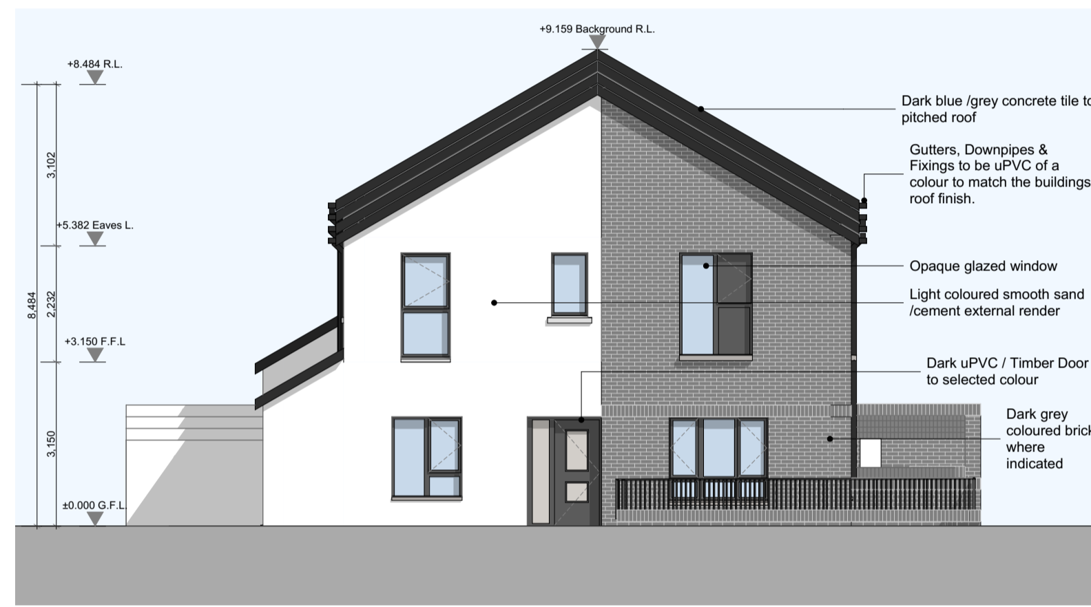
E-02 Elevation 1:100