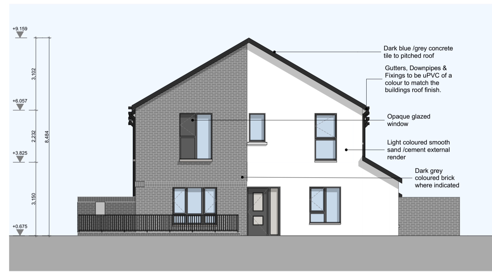
E-04 Elevation 1:100