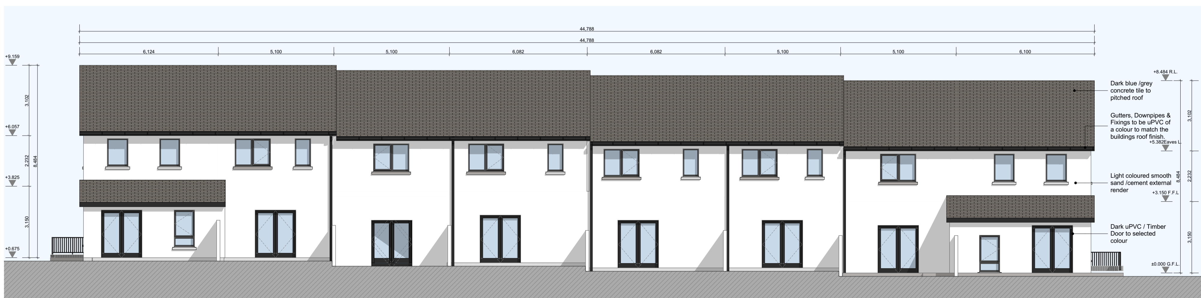
E-03 Elevation 1:100