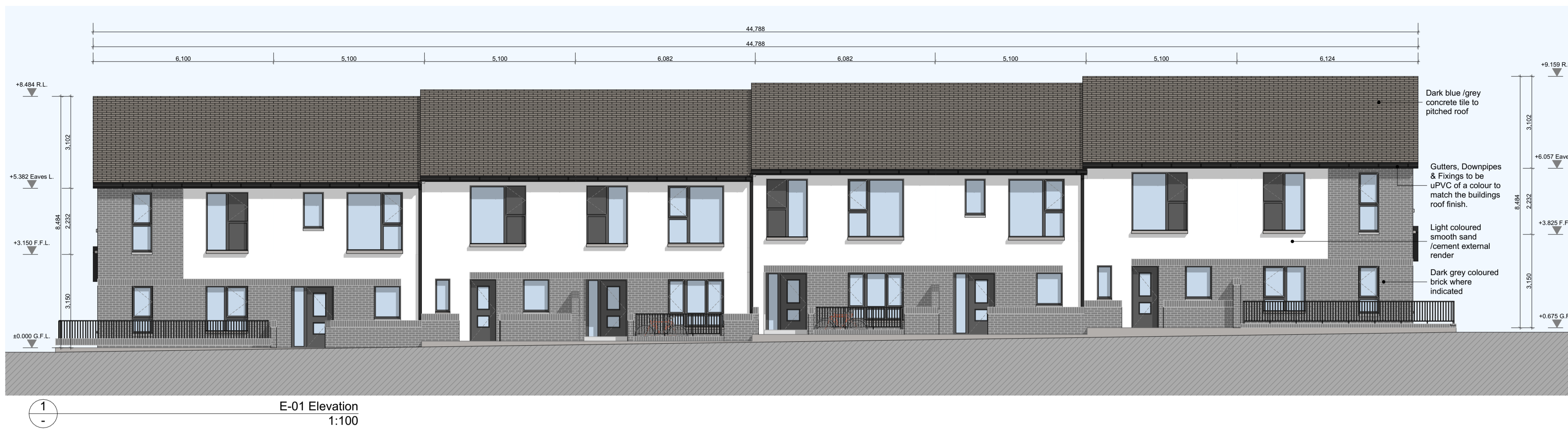
E-01 Elevation 1:100