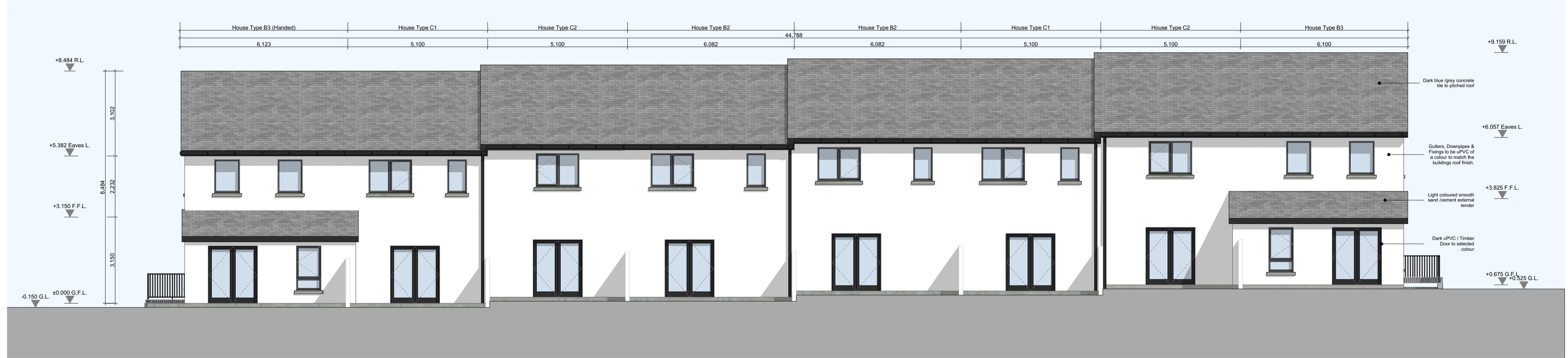
05 E-03 Elevation 1:100