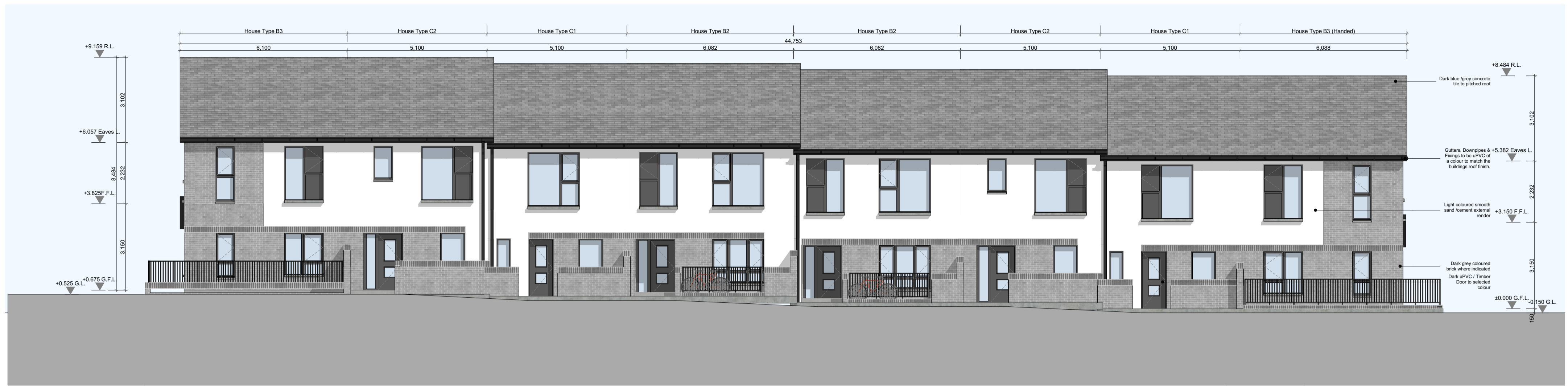
01 E-01 Elevation 1:100