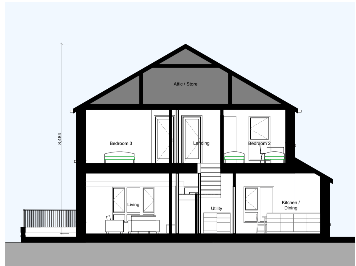
04 S01-Section 1:100