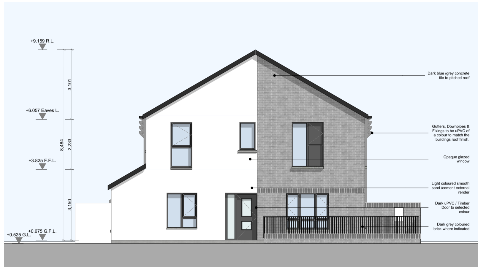
02 E-02 Elevation 1:100