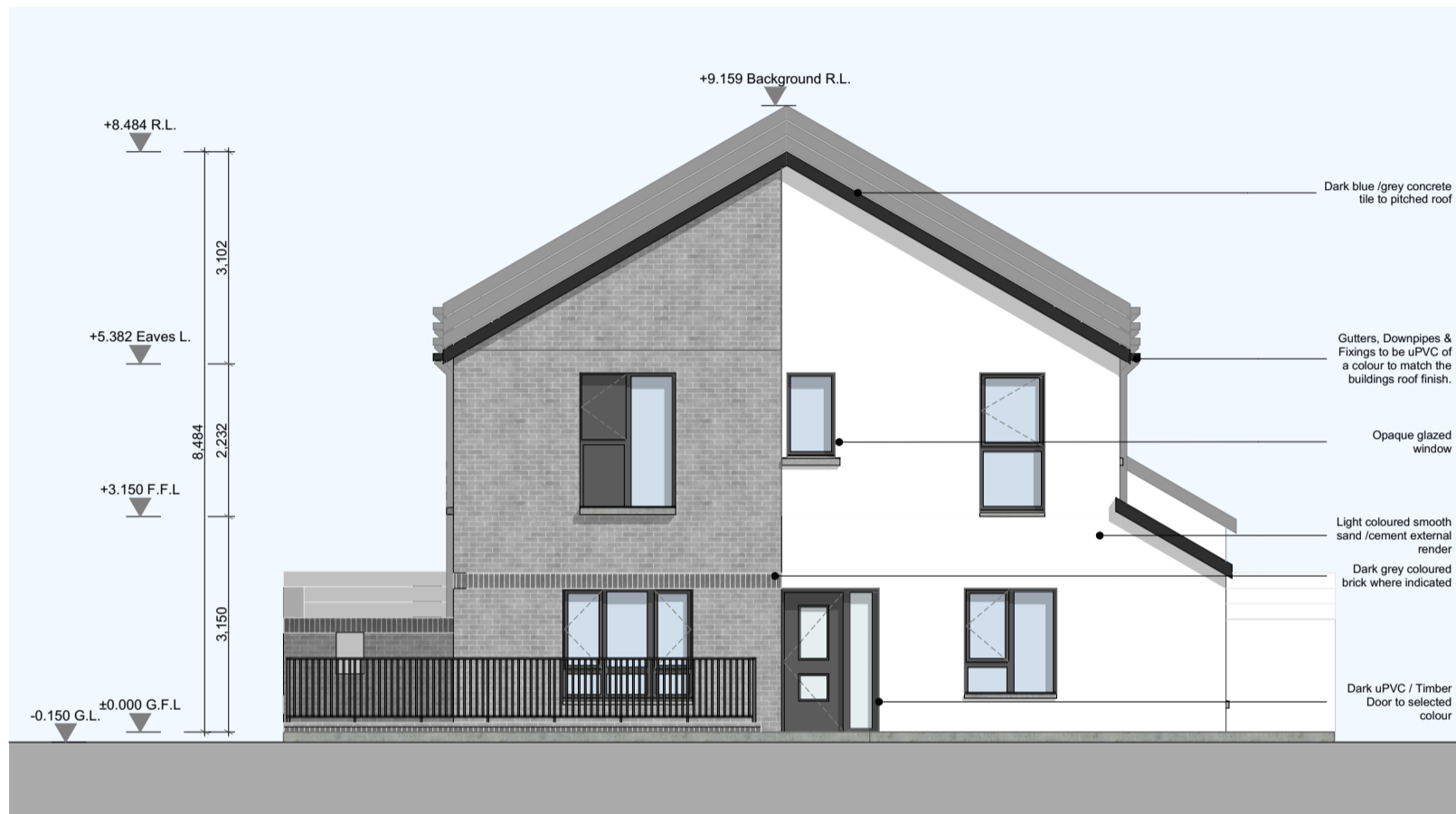
03 E-04 Elevation 1:100