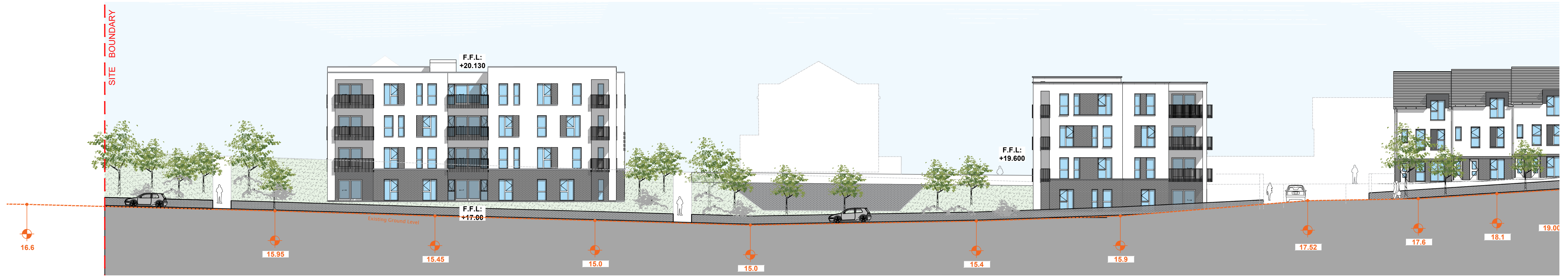
01 Site Section 7-7 Scale 1:200