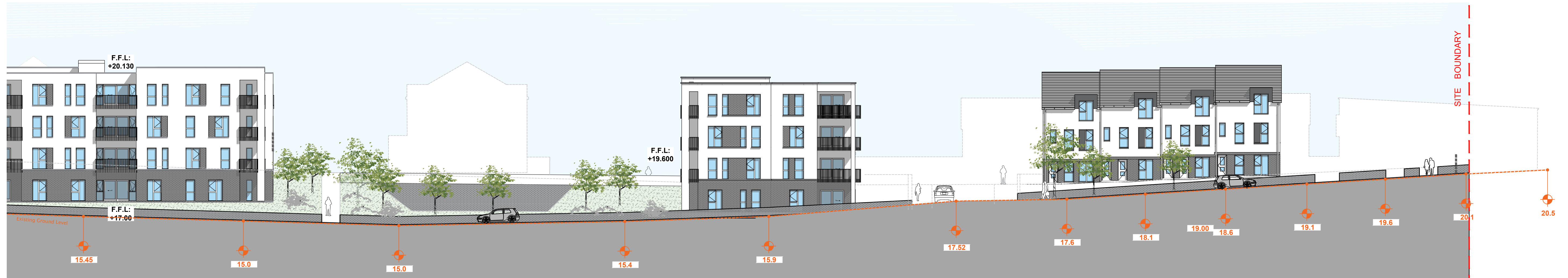
02 Site Section 7-7 Continued Scale 1:200