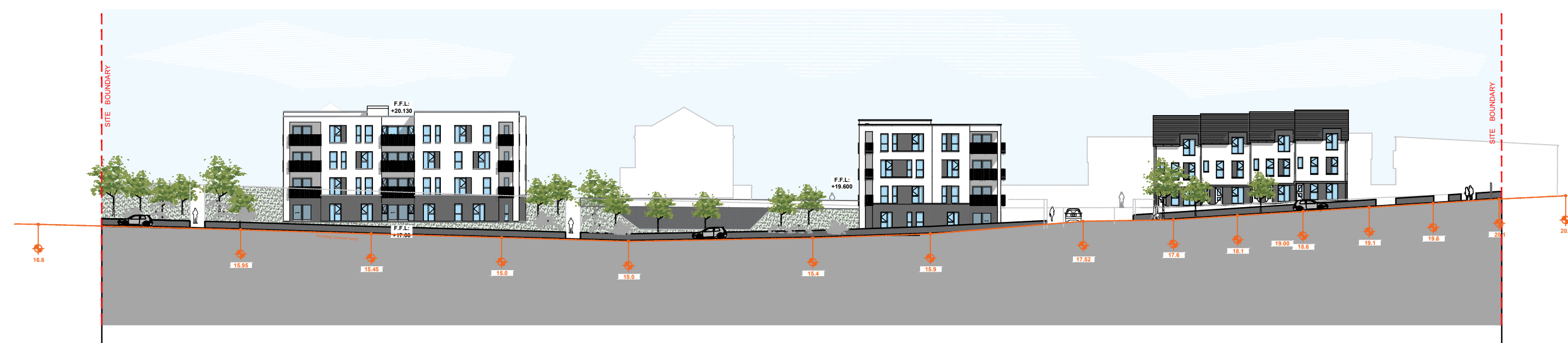
03 Site Section 7-7 Scale 1:500