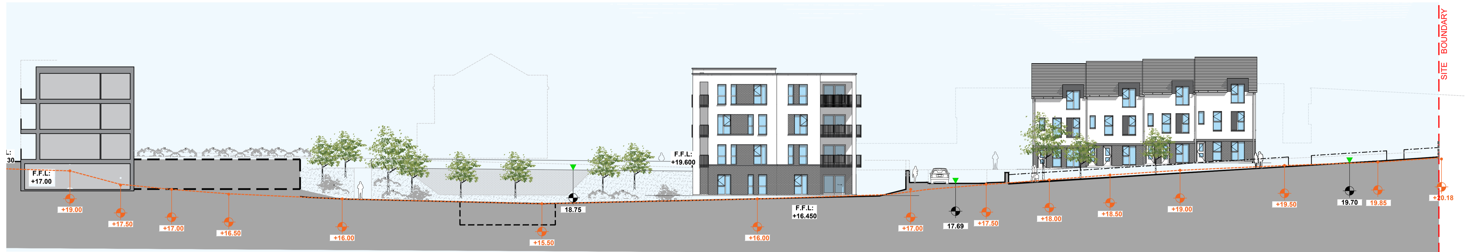
02 Site Section 6-6 Continued Scale 1:200