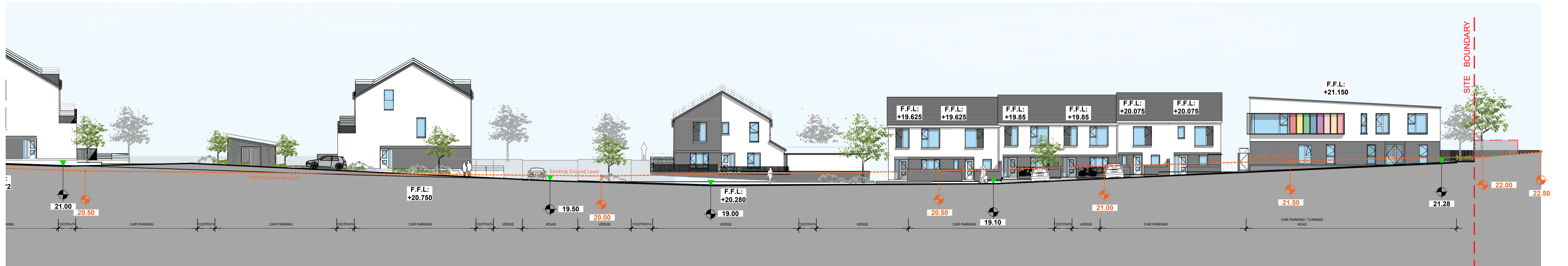
02 Site Section 5-5 Part 02 Scale 1:200