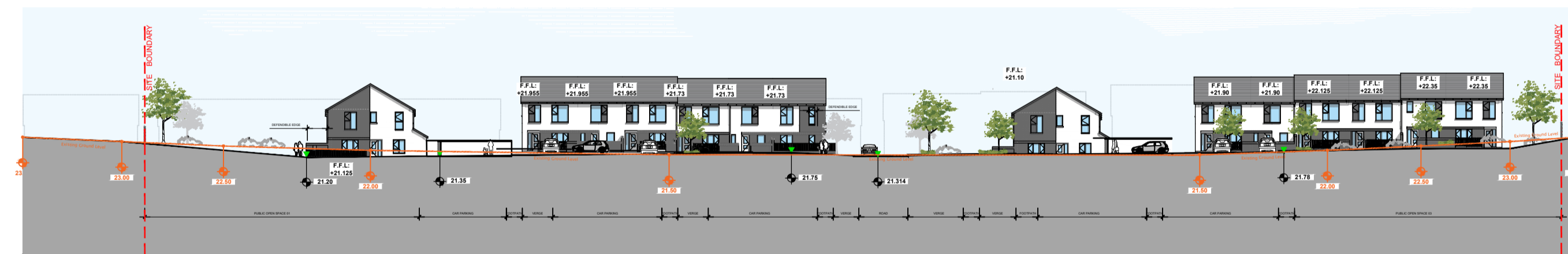
03 Site Section 4-4 Scale 1:500