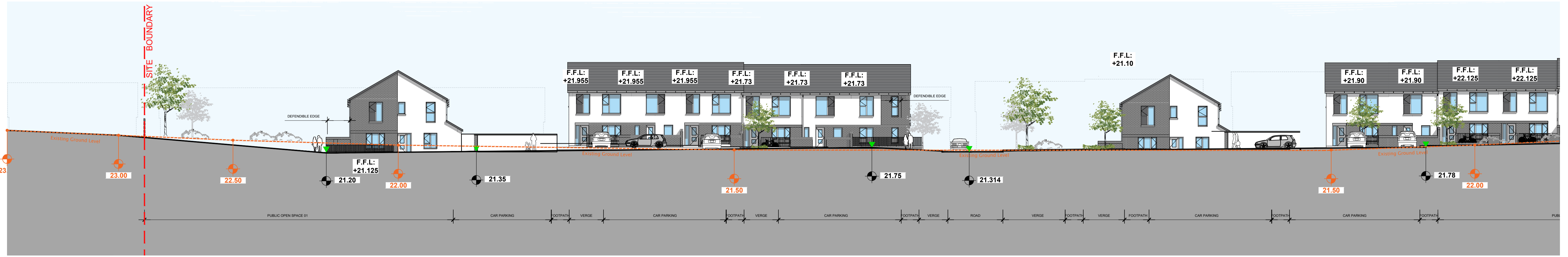
01 Site Section 4-4 Part 01 Scale 1:200