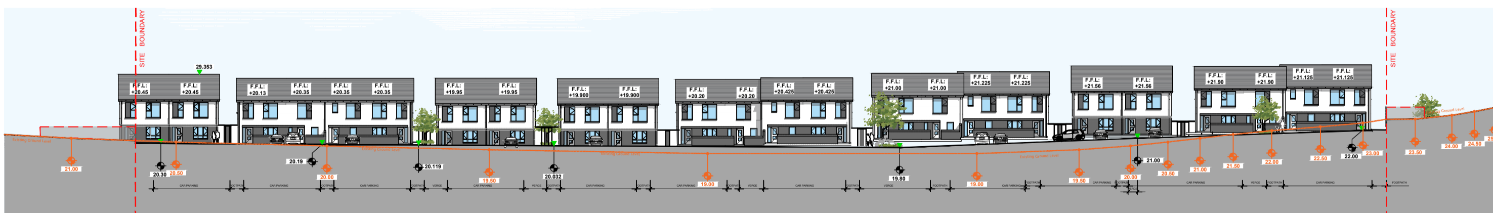
03 Site Section 3-3 Scale 1:500