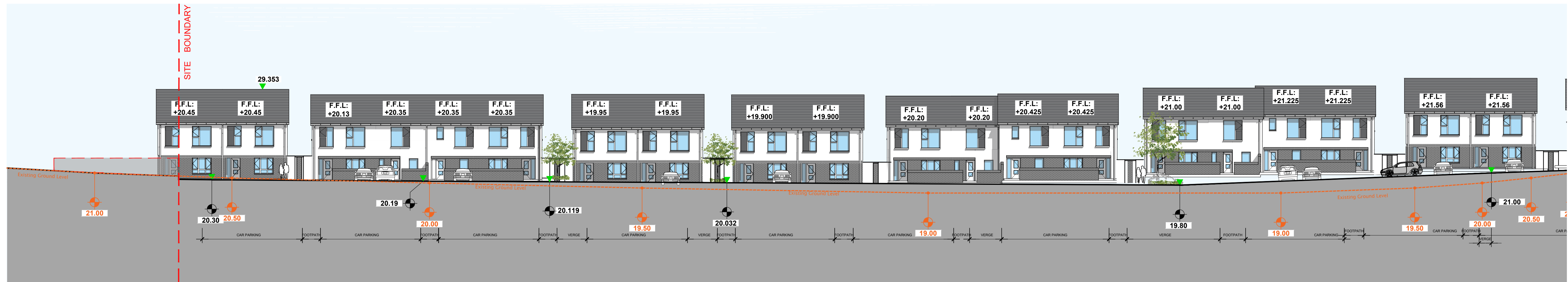
01 Site Section 3-3 Part 01 Scale 1:200