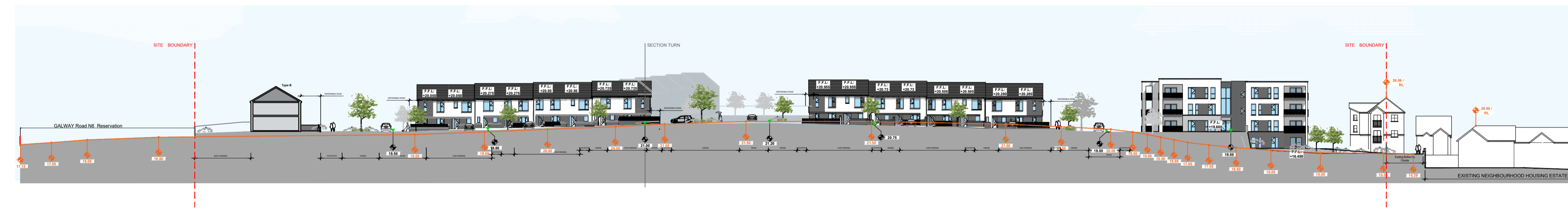
03 Site Section 2-2 Scale 1:500

REFER TO ARCHITECT'S MASTER SITE LAYOUT PLAN 3004 FOR NORTH ORIENTATIONS.