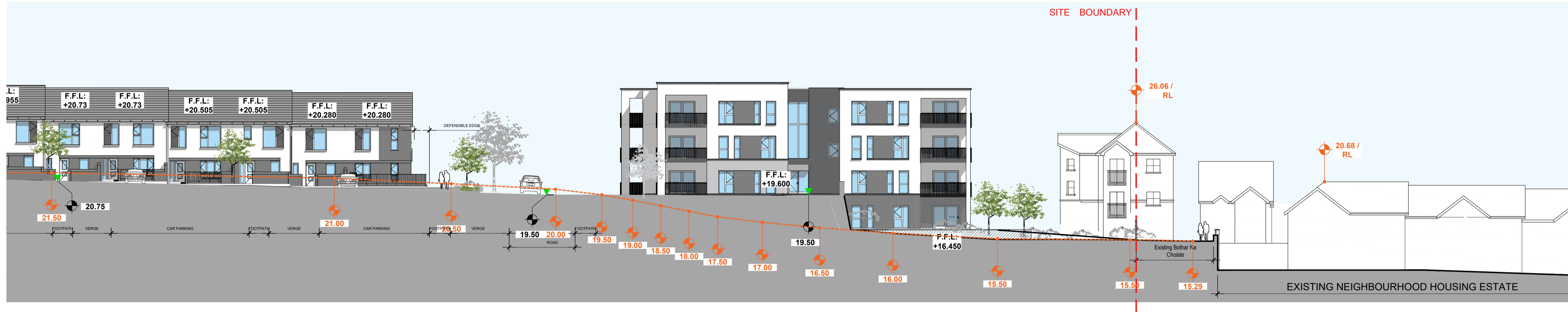
02 Site Section 2-2 Part 02 Scale 1:200