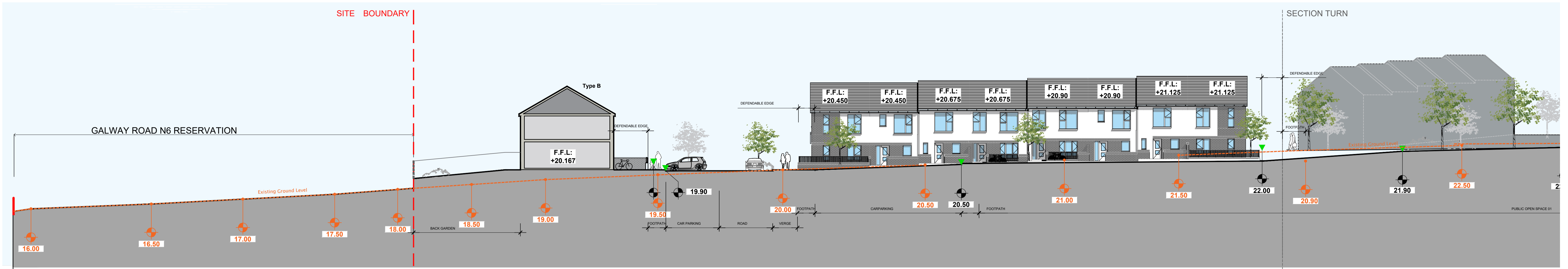
01 Site Section 1-1 Part 01 Scale 1:200