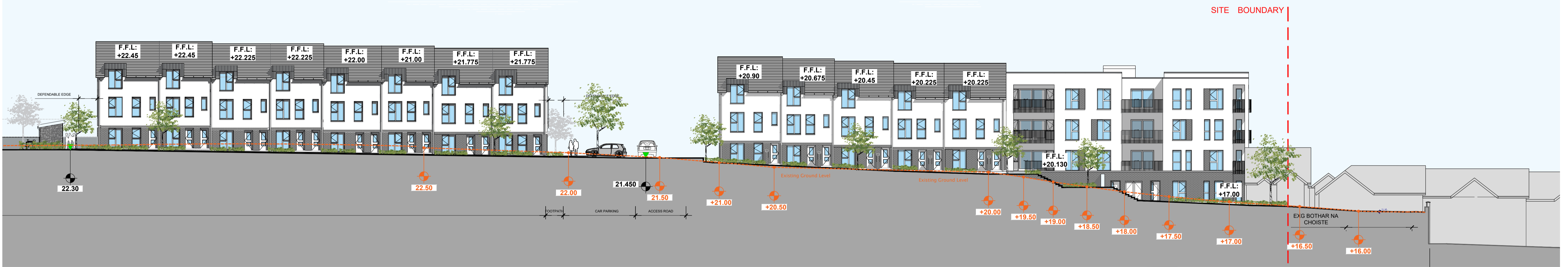
02 Site Section 1-1 Part 02 Scale 1:200