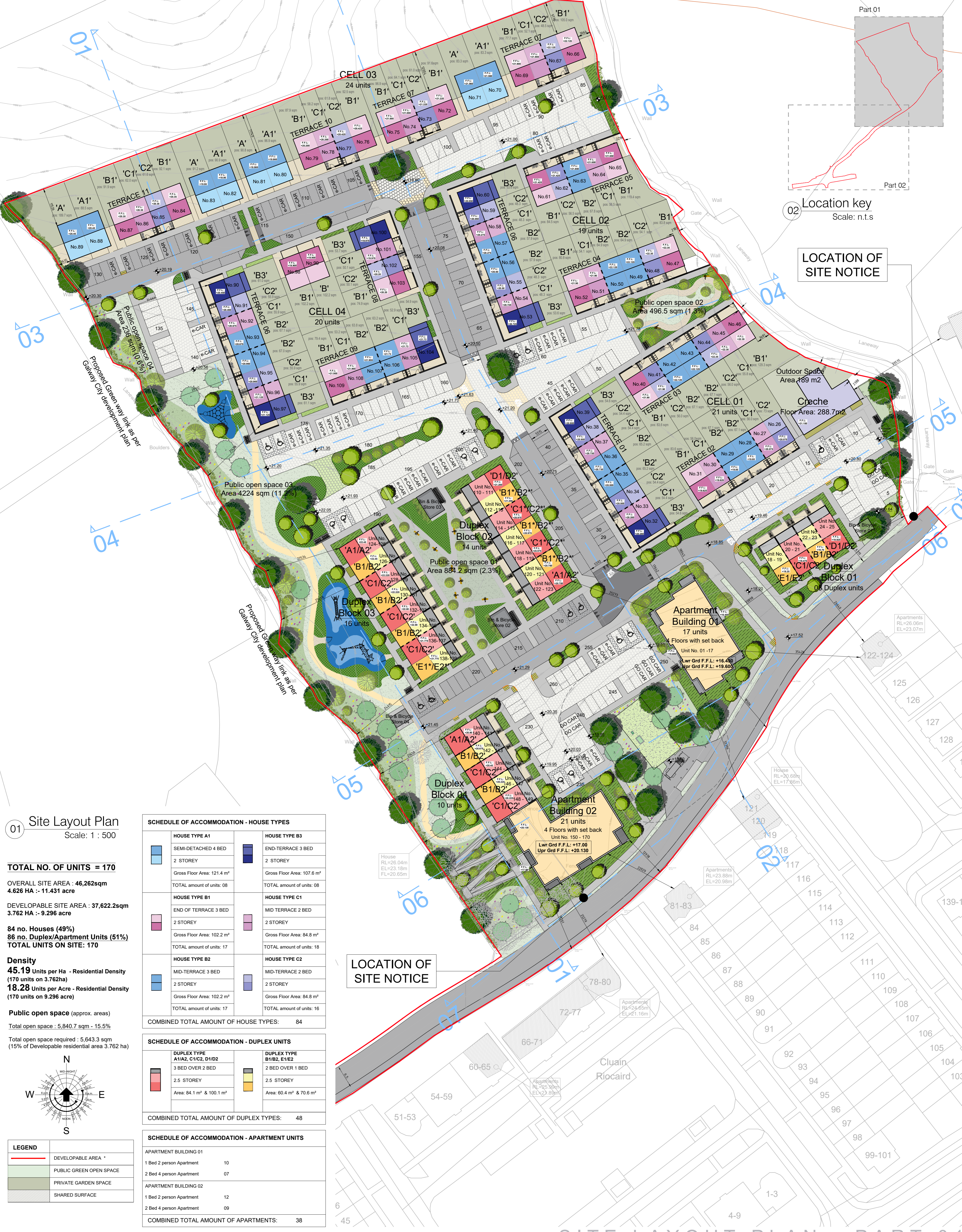
01 Site Layout Plan Scale: 1 : 500