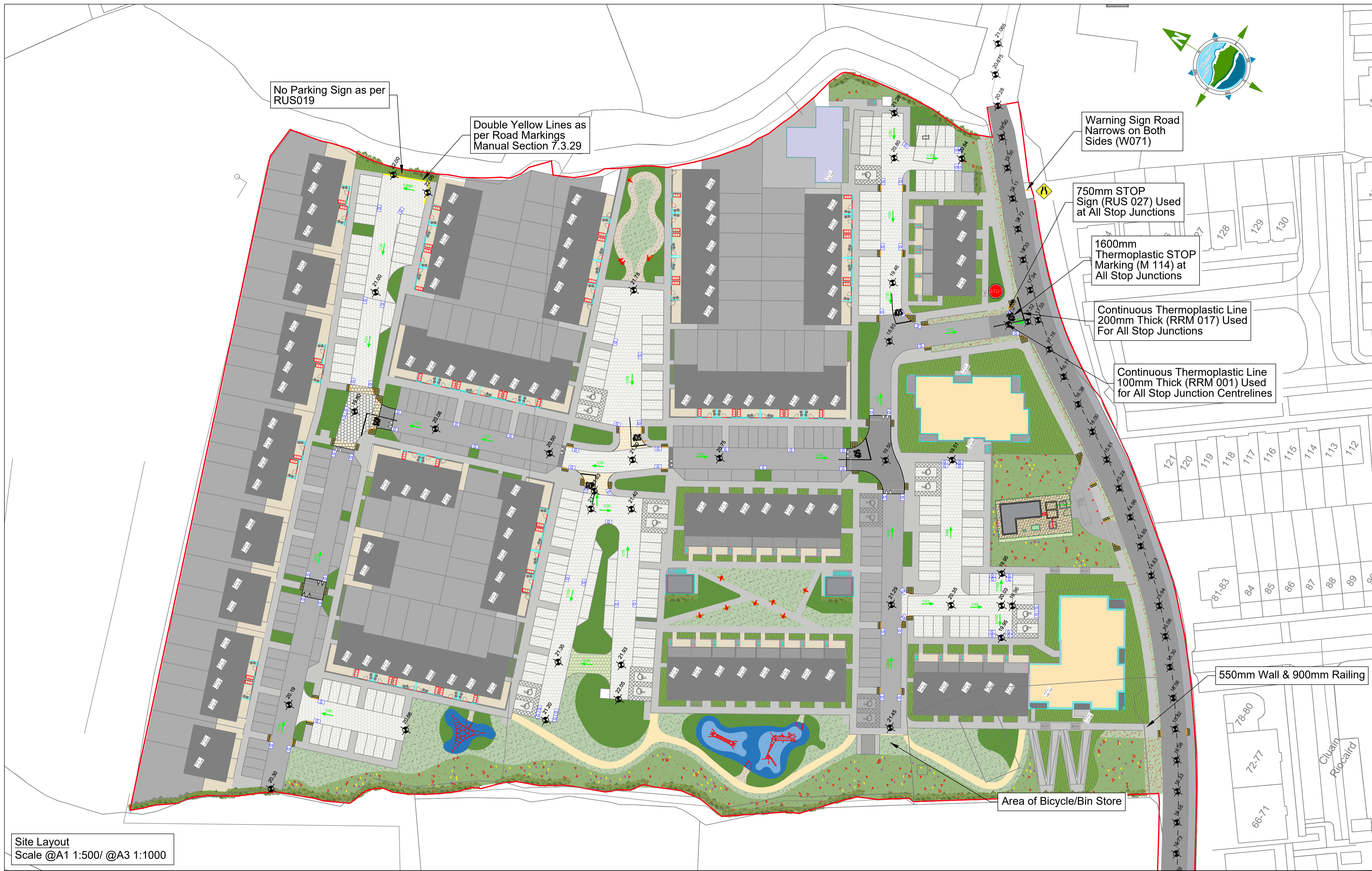
Site Layout Scale @A1 1:500/ @A3 1:1000

TOBIN CONSULTING ENGINEERS Galway Office Fairgreen House, Fairgreen Road, Galway, H91 AXK8, Ireland. Tel: +353 (0)91 565 211 www.tobin.ie Drawing No.: 10750-2109 P01 Revision: